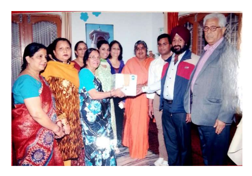
Educational tour MPEB for Nagar Nigam gov girls school Gwarighat Jabalpur With Rotary Club of Jabalpur EAST